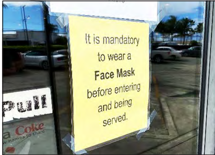
Stores posted signs on doors in an effort to obey Texas Gov. Greg Abbott's executive order on wearing masks.

"If Gregg County Sheriff's Office Deputies encounter an individual that refuses to voluntarily comply, verbal warnings and or written warnings will follow. As a very last resort a citation can be written at the discretion of the deputy.