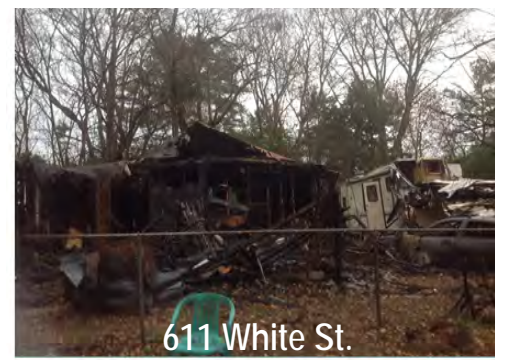
611 White St.