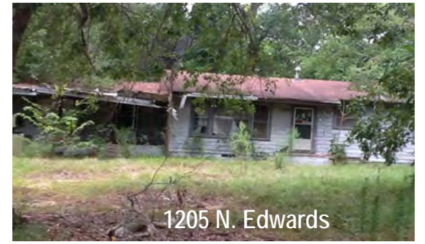
1205 N. Edwards

and grants the GFD would like to pursue with the approval of the City Council. He said that a Texas Forest Service grant for $15,000 with a grant match for $1,500 by Upshur County ESD #1 has been approved which will upgrade the pump and equipment for the truck used to fight grass/brush/wildland fires.