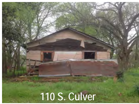
110 S. Culver