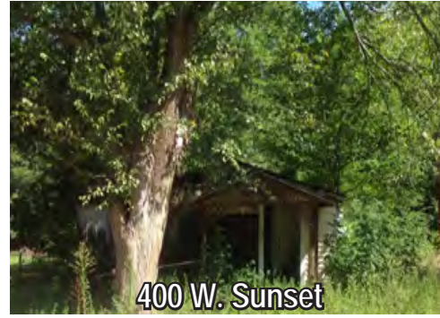
400 W. Sunset