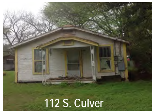
112 S. Culver